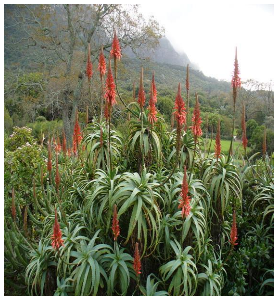
Aloe Arborescens (Krantz Aloe or