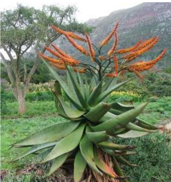
Aloe Marlothi (Mountain Aloe or Berg Aalwyn) Krantzaalwyn)

The two easiest species of aloes to recognize in our Estate gardens are the Aloe Marlothi and the Aloe Arborescens